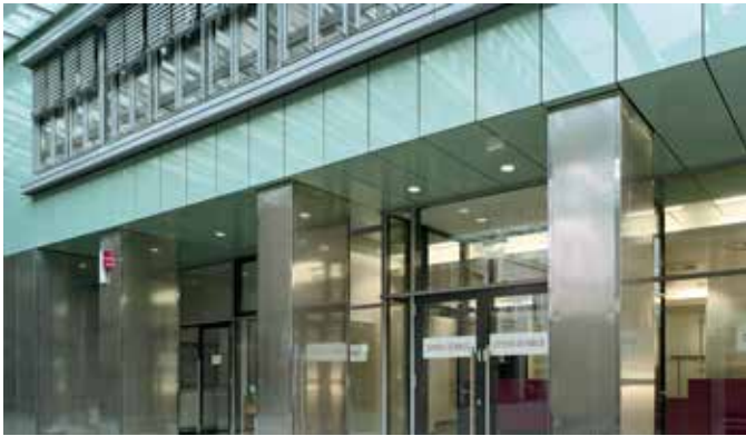
Hamburg State Opera, Hamburg, Germany Architect: Kleffel Könnholdt und Partner Architekten, Hamburg, Germany

The system looks good both on the facade and inside of a building and since StoVentec Glass has also been technically approved for ceiling liners, nothing can get in the way of overhead glazing.