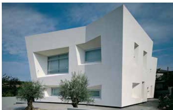
Office building Lumenart, Croatia, Pula Architect: Rusan Arhitektura, Croatia, Zagreb

The carrier board of the StoVentec R system forms an excellent adhesion primer for facade renders with numerous textures as well as grain sizes. It is formable in such way that even bent surfaces can be cladded perfectly. When it comes to colours, the StoColor System provides a wide range of design options. Even very dark facade surfaces pose no problem. Besides facade renders, StoDeco Profiles and Rustications, the StoVentec Carrier-Board Facade is also perfectly suited for the application of ceramics (StoVentec C), glass (StoVentec G), glass mosaic (StoVentec M) and natural stone panel tiles (StoVentec S).