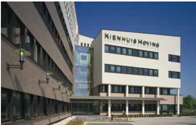
Photo above and cover picture: Kantoorpand-Kienhuis-Hoving, office building Drienerbeek, Enschede, Netherlands Architect: I/AA Architekten & Ingenieurges, Enschede, Netherlands

StoVentec S is an attractive alternative to heavy, massive natural stone facades and can therefore be used in structurally difficult situations. The system's carrier board forms an excellent adhesion primer for natural stone panel tiles with numerous textures and colour shades. Besides Sto-Natural Stone Tiles, StoDeco Profiles, and Rustications, the StoVentec Carrier-Board Facade is also perfectly suited for the application of ceramics (StoVentec C), glass (StoVentec G), glass mosaic (StoVentec M) and render (StoVentec R).